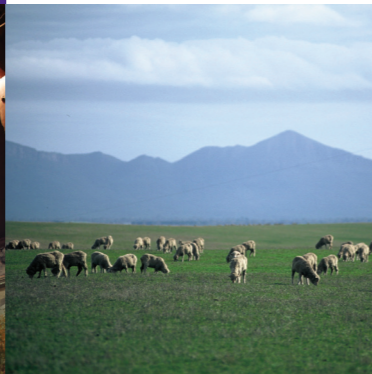
Head to Robson's Lookout for one of the best views of the Grampians Ranges