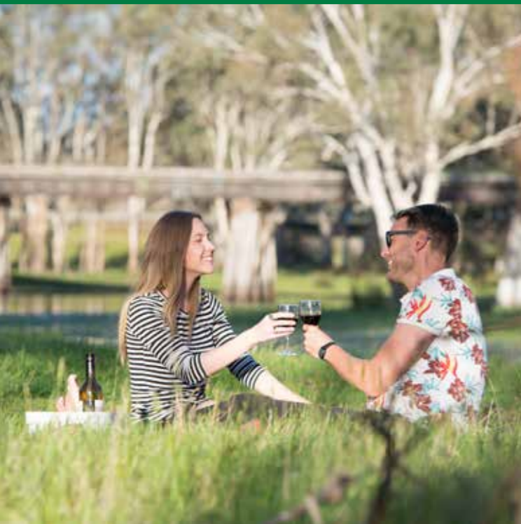
Enjoy peace and tranquil riverside camping

Enjoy the views of the river and the recently restored trestle bridge from the back verandah of the community owned art deco Bunyip Hotel, with a cool ale close by of course, or walk along the banks of the Wannon River and enjoy lunch at the Bridge Cafe.