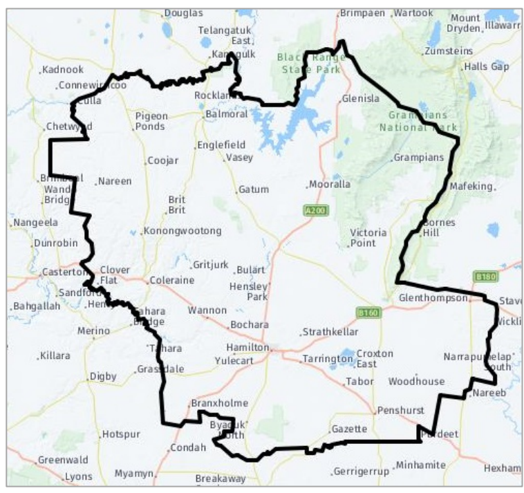
Figure 1 Southern Grampians Shire Council Map