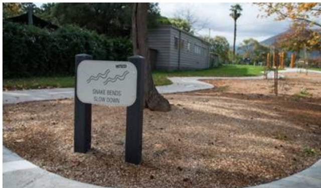
Queens Park Healesville - Example role play bike facility