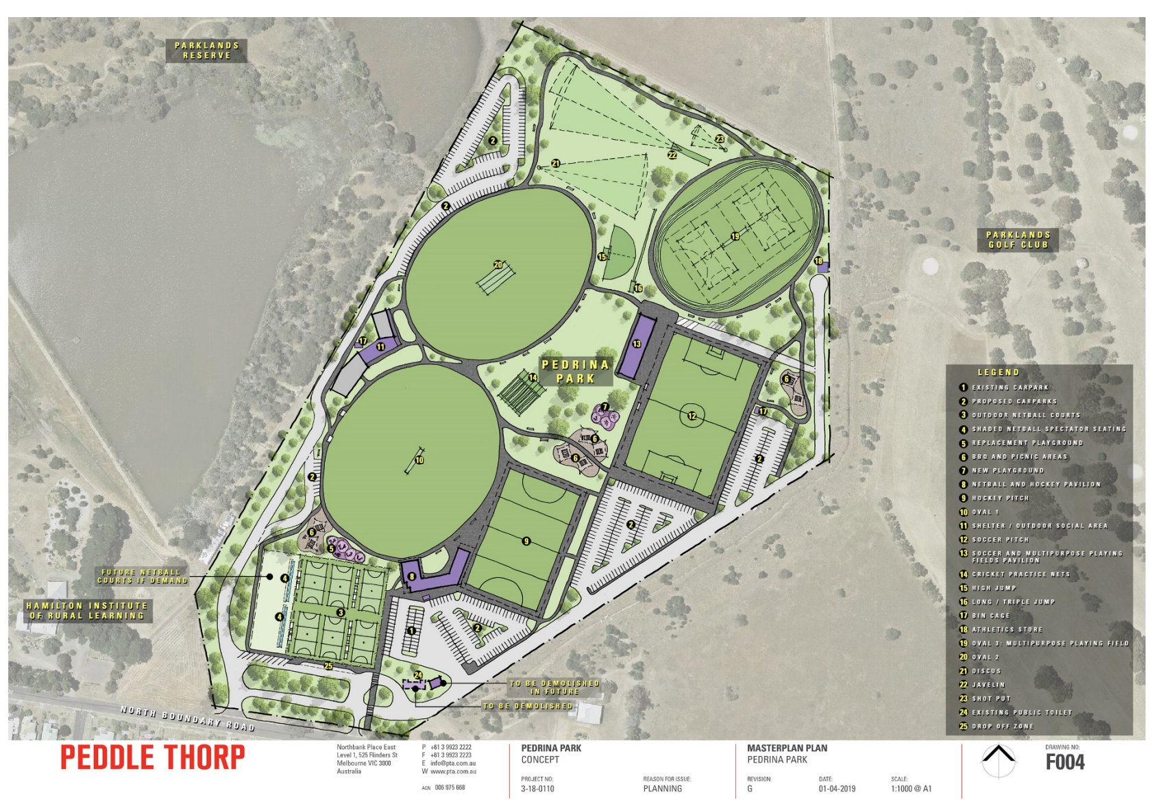
Figure 4 Pedrina Park Masterplan