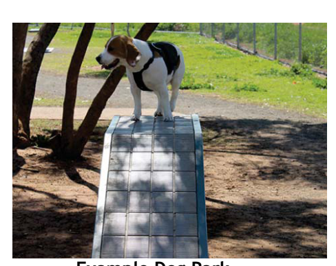
Example Dog Park