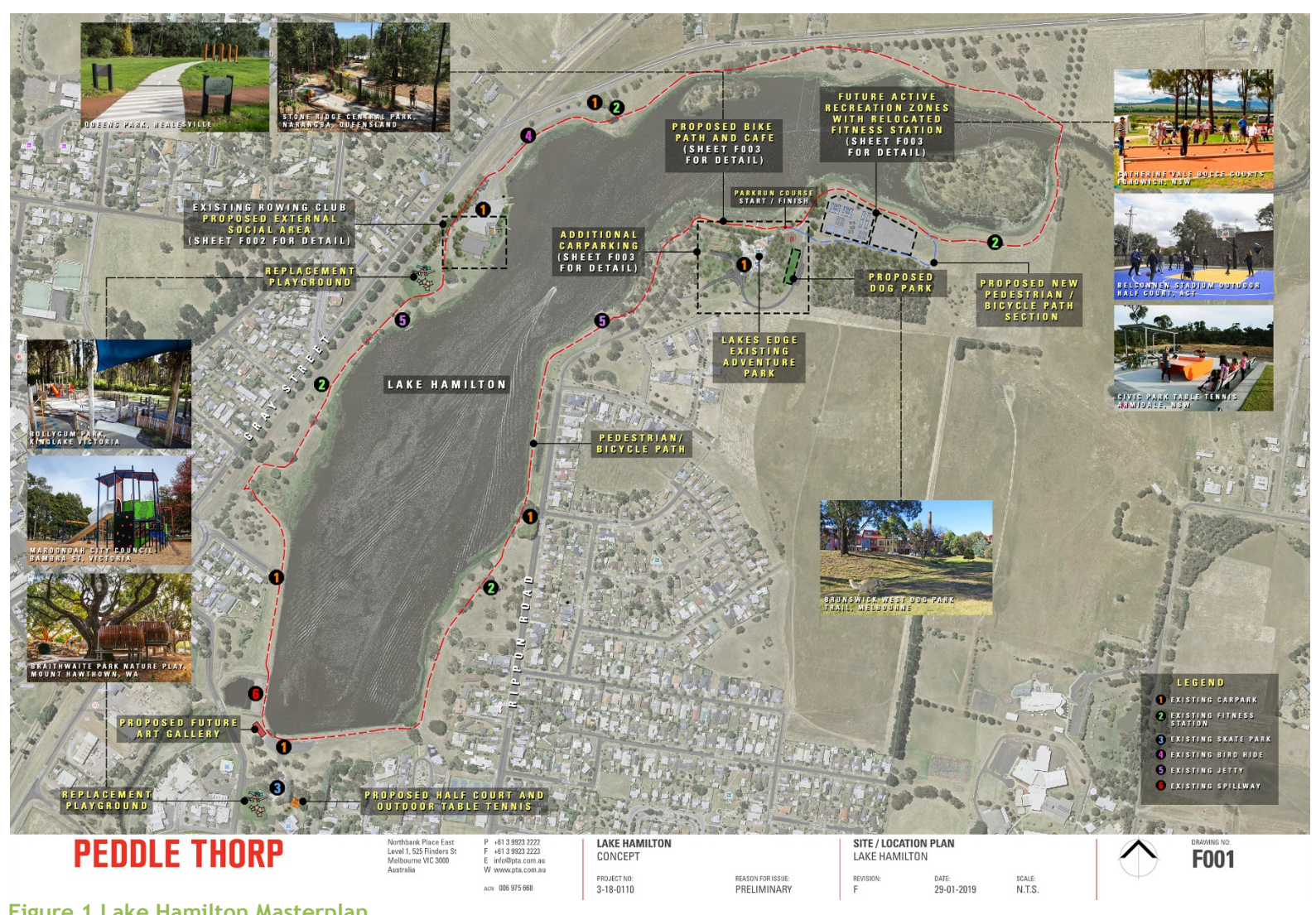
Figure 1 Lake Hamilton Masterplan