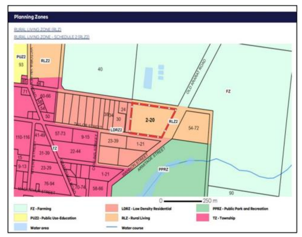
Existing Zone – Rural Living Zone