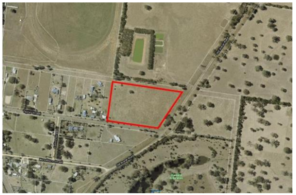
Aerial photo of subject land

The planning permit application proposes to allow, subject to conditions, a four (4) lot subdivision.